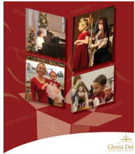
2011 Holiday Opportunities

It may seem a bit early to write about Christmas, but for planning sake, it is not. We want to make sure that you have an opportunity to mark us in your calendar before other commitments stream in. Hospitality team members will be handing out the Holiday Opportunities booklet today after worship. Take some time and mark your calendars for the activities that will enrich your Christmas season.